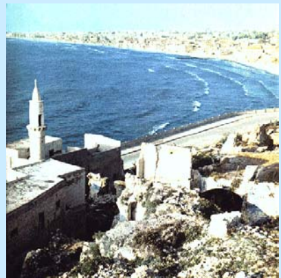
The Sea Port City of Joppa