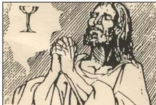
Jesus my hope and my salvation

02/05/2006: Mid Term Examination 02/24/2006: LA Clipper Basketball Game (vs. Lakers) 03/04/2006: Social Work (Help the poor & needy)