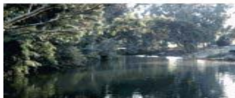
Jordan river near exit from Galilee, traditional site of baptism of Christ

Boys and girls need to learn to do right because it's the right thing to do. Parents and teachers offer rewards, stars, and stickers. That's fun and that's OK, but our goal should be to do the things we are asked to do simply because it is "the right thing to do".