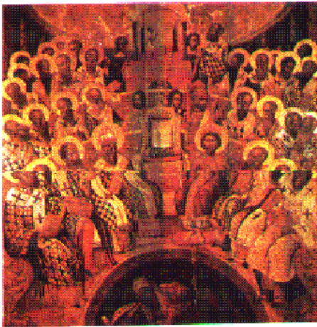
Nicean Council 1

The Nicean Creed was composed by the Fathers of the 1st and 2nd Ecumenical Councils. The first seven articles of the Creed were drawn up at the 1st Ecumenical Council, and the last five were drawn up at the 2nd Ecumenical Council. The 1st Council met in Nicea in 325 A.D. to confirm the true teachings about the Son of God and to oppose the false teachings of Arius. Arius believed that the Son of God was created by God the Father.